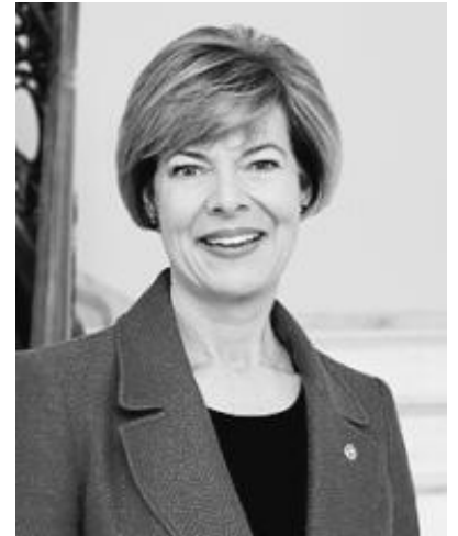
Senator Tammy Baldwin (D – WI), Politician, lawyer, and United States Senator since 2013

https://newhorizonsunlimited.wordpress.com/